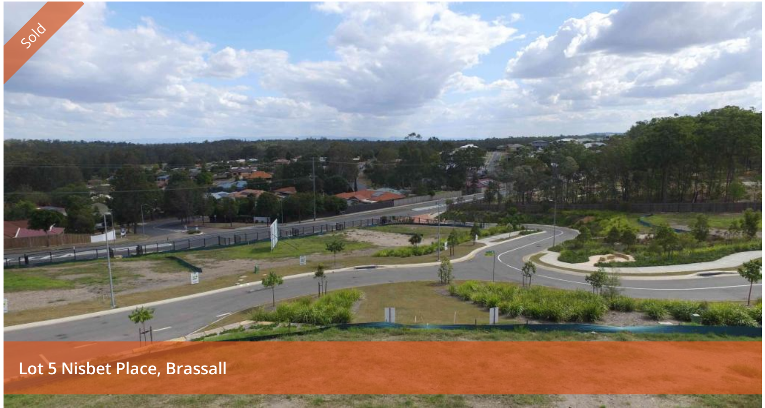
Lot 5 Nisbet Place, Brassall