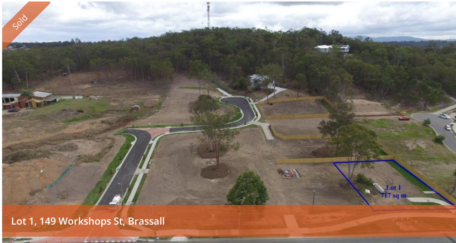
Lot 1, 149 Workshops St, Brassall