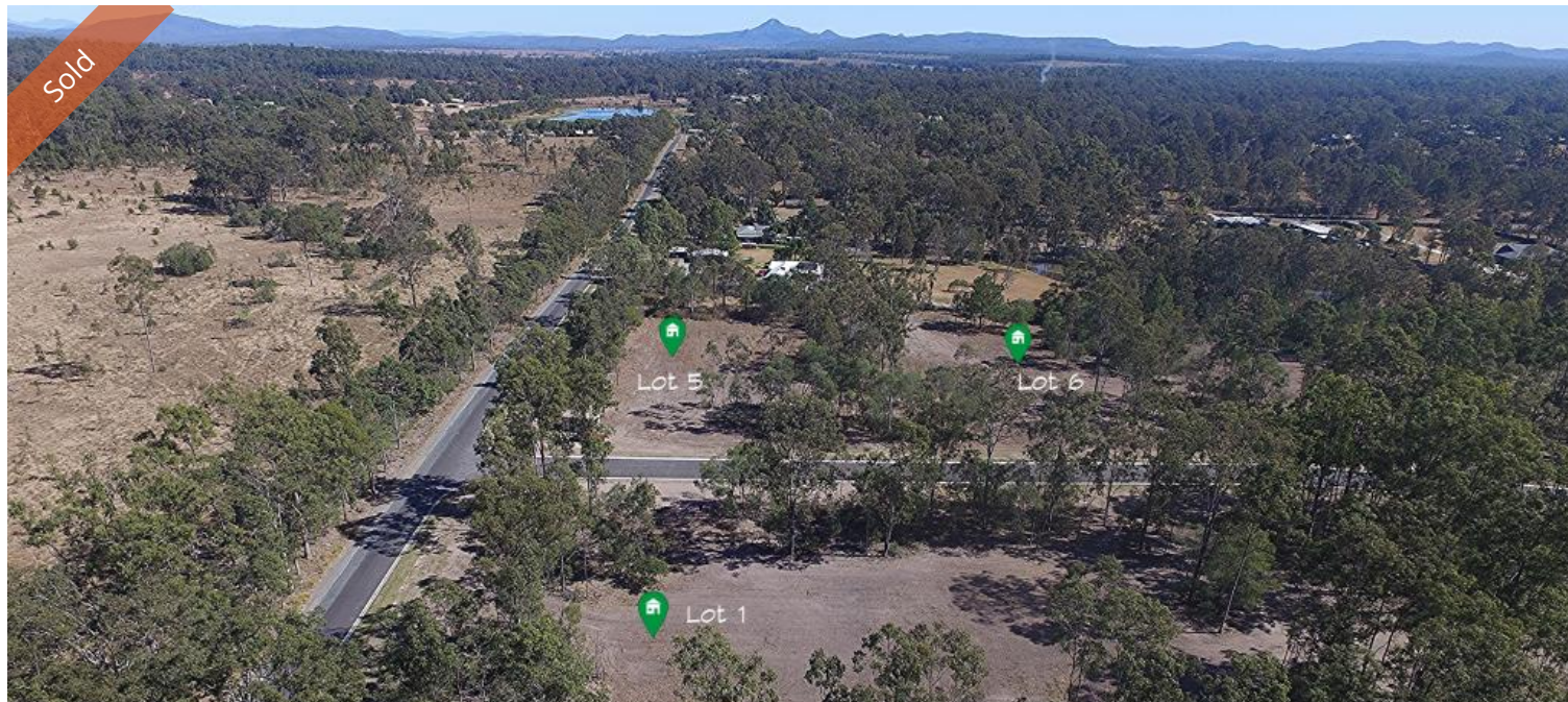
Lot 1, 19-27 Catania Place - Round Ridge Rd, Jimboomba