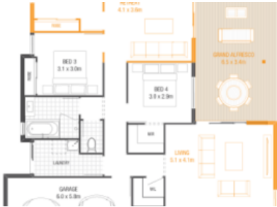
Image may depict features such as landscaping, timber decking, furniture, window treatments and lighting which are not included in the package price. Image is for illustrative purposes only.